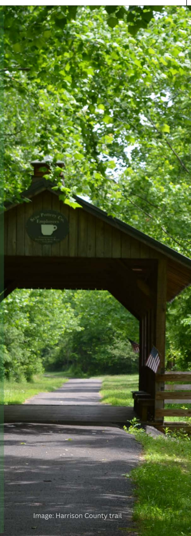
Image: Harrison County trail

In Belmont County, Barnesville includes two cornerstone properties to move the Downtown Revitalization Plan forward. The Ohio Hills Health Center will expand access to primary care, dental, behavioral health, and addiction services.