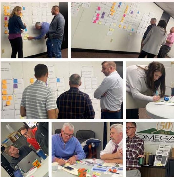
Image: OMEGA-guided work sessions to define ACG projects.

Travels north lead to popular Amish tourism destination, Holmes County, where they aim to complete the Holmes County Trail through Glenmont to its Main Street; to Millersburg's water trailhead accessing Killbuck Creek; to Holmesville's community park; to Killbuck's Turtle Pond Preserve, all designed for non-motorized use, including horse and buggy.