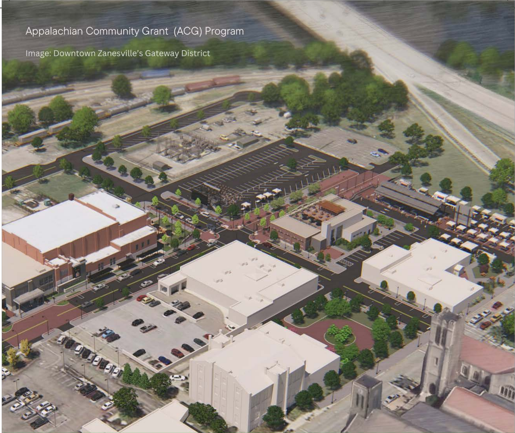
Image: Downtown Zanesville's Gateway District