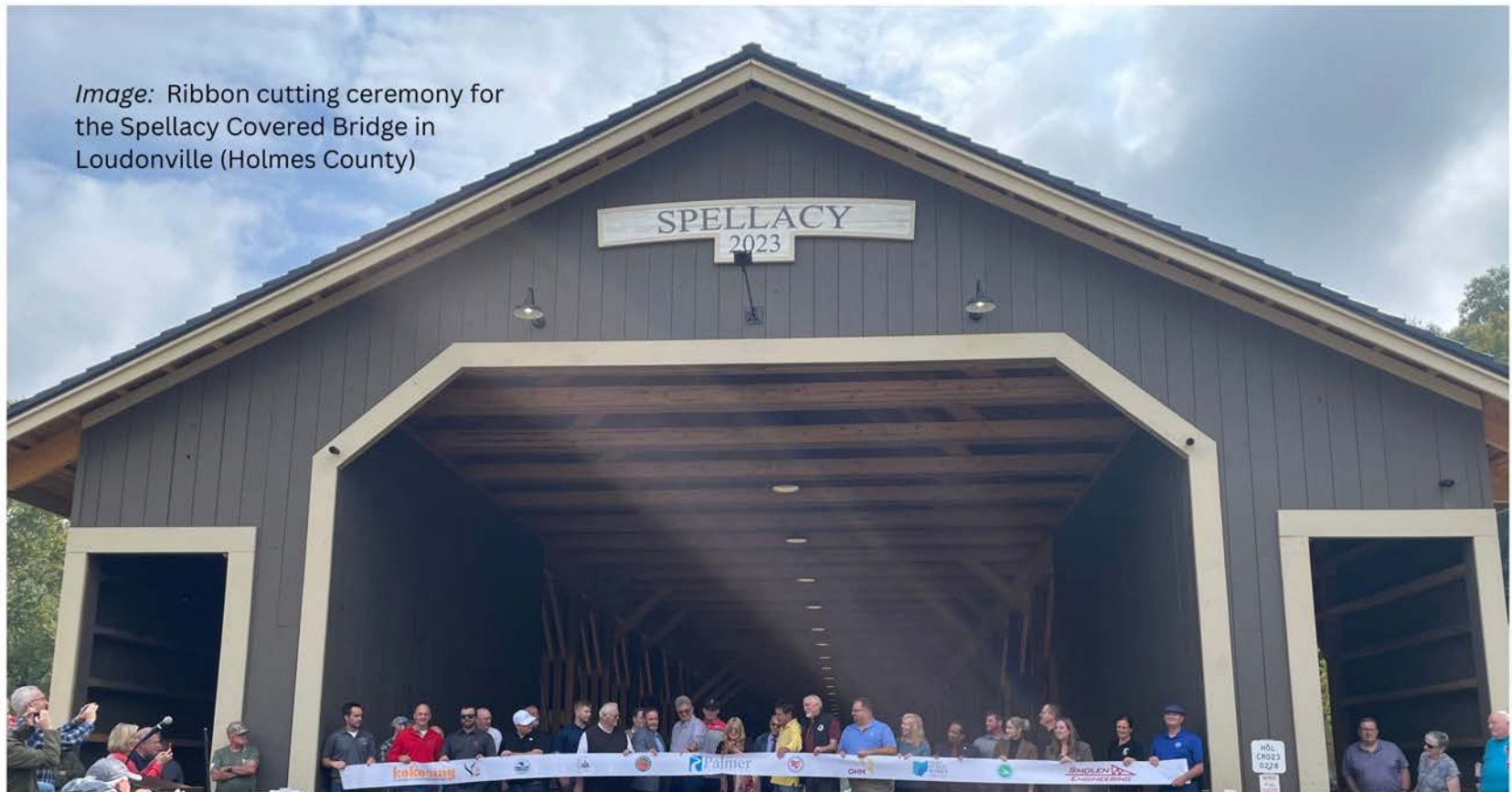
Image: Ribbon cutting ceremony for the Spellacy Covered Bridge in Loudonville (Holmes County)

With 19 approved grant applications and two approved loans from OMEGA's Revolving Loan Fund in 2023, OMEGA helped secure $16,485,824 in grants for communities and organizations and $360,000 in low-interest loans to businesses, leading to the creation of a total of 106 new jobs in the OMEGA Region in 2023.