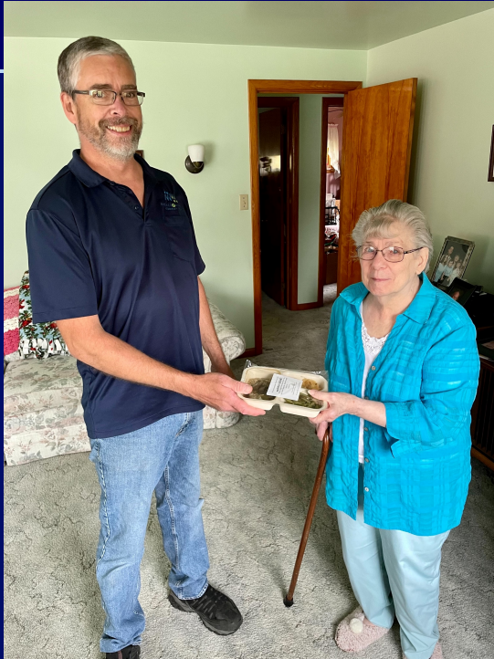
Meals on Wheels

Upon the completion of a personalized nutritional needs assessment, home delivered meals are provided five days a week to eligible individuals. Pre-prepared frozen meals, which are oven or microwave ready, are available for weekends and holidays upon request. Emergency meals are also provided in anticipation of inclement weather.