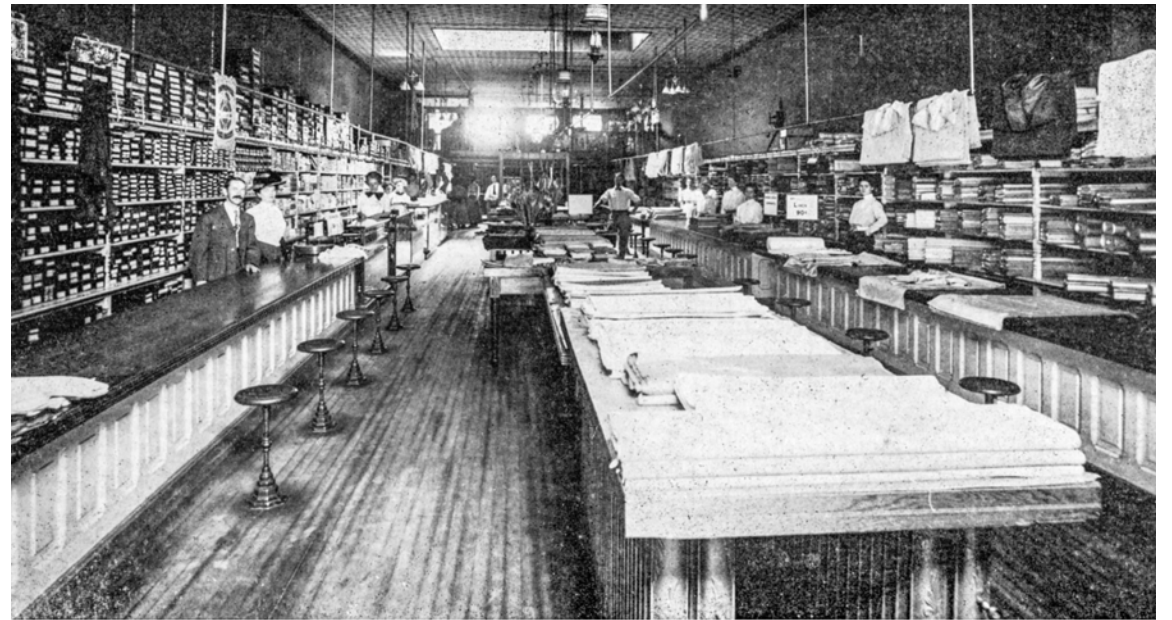
POTTER BROS., DRY GOODS

Bought out by Bonham's in the 1970s, the store continued to operate until closing several years later