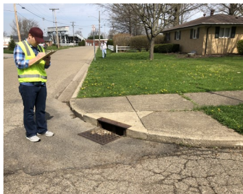
Safe Routes to School