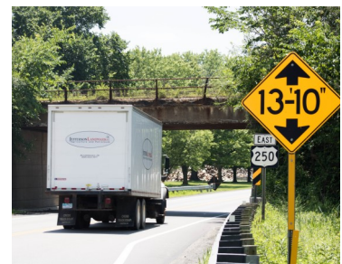
US 250 RR Overpass