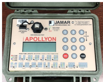
New Traffic Counters