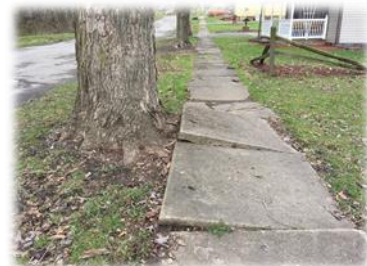
Targeted Infrastructure Improvements for Harrison Hills Safe Routes