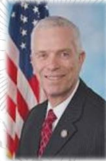
U.S. Congressman Bill Johnson