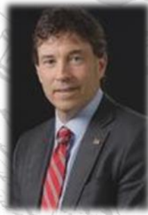
Ohio Senator Troy Balderson