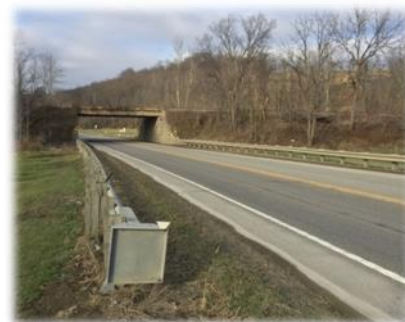
Railroad Bridge over US Route 250 - FASTLANE grant